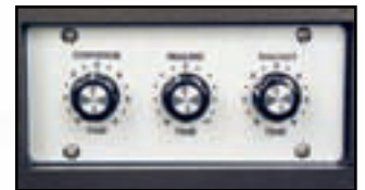
Sealer Control Panel