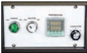
Tunnel Control Panel