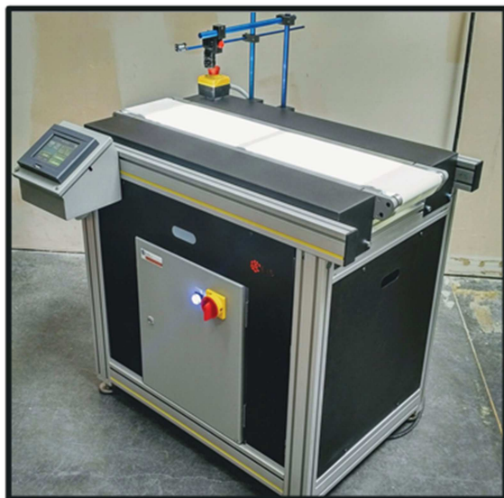
Complete 1m module shown with mounting brackets and touch screen.