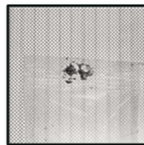
Hot seal with contaminant