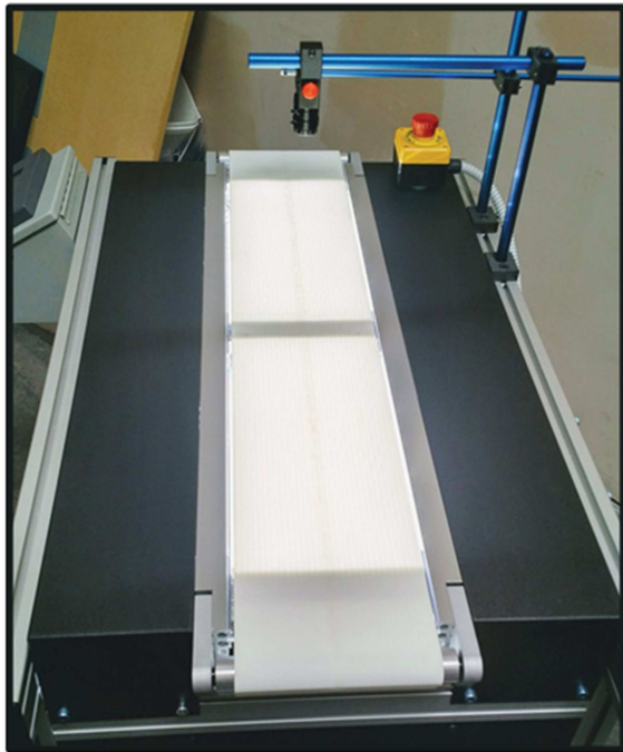
1m conveying module with 2 backlit sections.